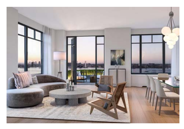
The desire for outdoor opportunities is fulfilled in Greenwich West

Using the course of the sun is crucial for comfort: "All windows have deep, curved marble window sills. These are shaped to remind you of the quality of a Parisian fireplace. Their inviting ogee curves offer space to relax and direct access to natural elements such as light or - through the stone - earth ".