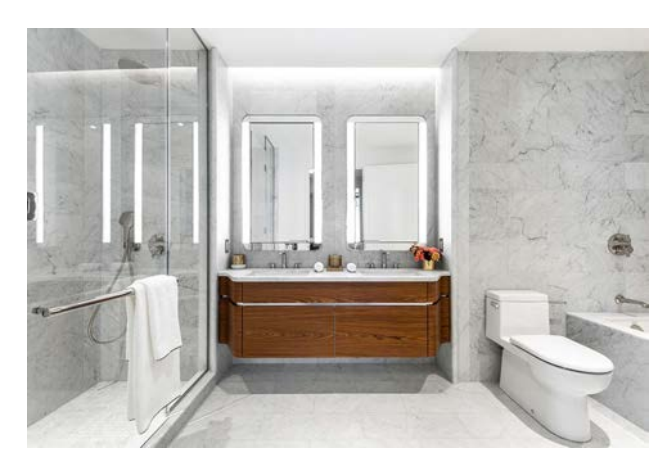
The bathrooms are designed as high-quality relaxation oases.

Segers designed the main bathrooms as relaxing hideaways: walls, shelves, floors and showers are covered with Carrara marble. Wall-mounted washbasins made of rosewood and polished nickel fittings make the inviting picture perfect.