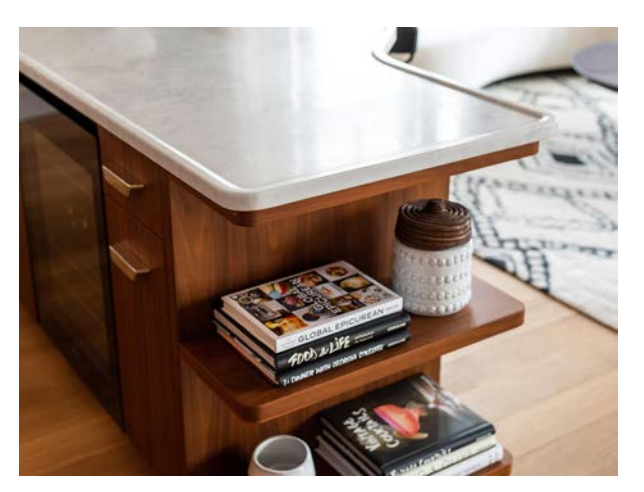
... and many well-thought-out, practical details.

Segers designed the main bathrooms as relaxing hideaways: walls, shelves, floors and showers are covered with Carrara marble. Wall-mounted washbasins made of rosewood and polished nickel fittings make the inviting picture perfect.