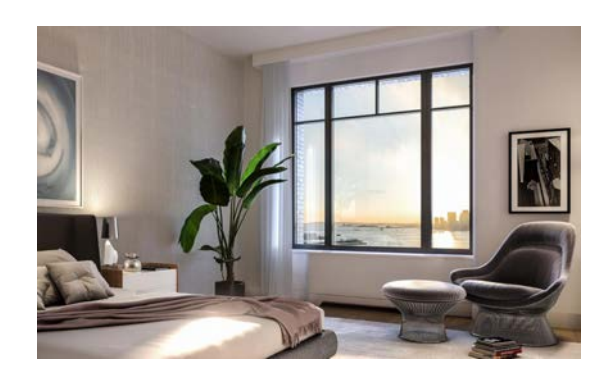
Stylish security: Master bedroom in a model apartment of the new residential tower designed by Sébastien Segers.

Whereby: The choice of colors must also underline the naturalness of the environment: "I combine light tones with this rich, warm range of materials. In particular blue and orange-red nuances, which refer to water and fire ".