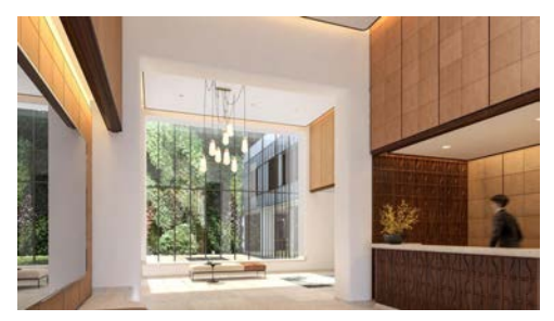
... and lobby with doorman.

At Greenwich West, he wasn't just inspired by the neighborhood's maritime history, Segers reports. Elements of French mid-century modern architecture also characterize the interior. Just like such Scandinavian designs and Japanese aesthetics.