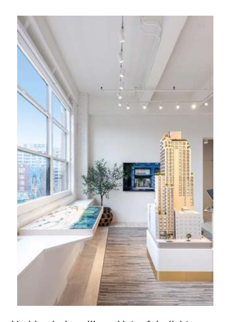
Usable window sills and lots of daylight \dots

An impressive scenario awaits the residents as soon as they enter the residential tower: a marble staircase leads to a high lobby. There travertine reign, walls clad with leather and finely worked rosewood. According to Segers, the sophisticated design is reminiscent of Tokyo's legendary Okura Hotel: "It represents grandeur. The elements and subtle references have been modernized and integrated into Greenwich West". The warm color palette as well as the natural materials and intricate wood paneling are important pillars of Japanese design.