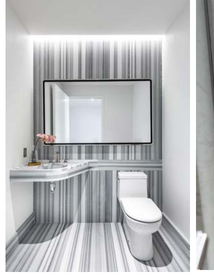
In Greenwich West the toilet is also a pleasure for the guest.

Even Greenwich West's guest toilets are a feast for the eyes. Sheathed with zebrino marble and provided with specially made, curved washbasins, they should remind you of the seashore. An association that also awakens many other elements of the new residential tower.