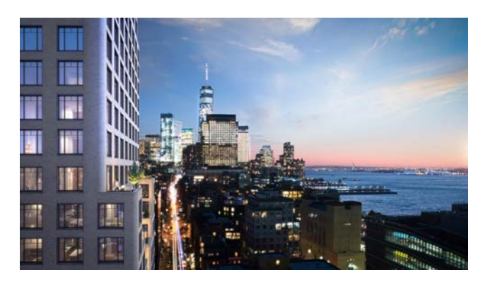
"Vive la France" in Greenwich West: Art Deco elements charmingly separate the residential tower from the surroundings.

There is, for example, the hand-made brick facade with specially glazed brick accents, which were specially made for the project by the venerable brick factory Wienerberger in Belgium. The art deco-inspired, rounded corners of the building make Greenwich West look soft and friendly.