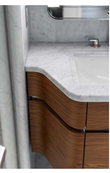
Top design with zest and quality also rules in the bathrooms.